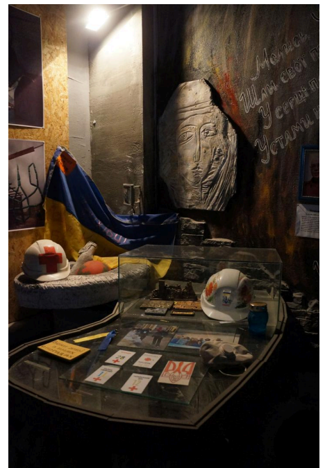
The interior of the Museum of the Heavenly Hundred in Ivano-Frankivsk is the result of a collaboration between artists, activists and event participants, October 2018.

The result was an unprecedented democratic space that