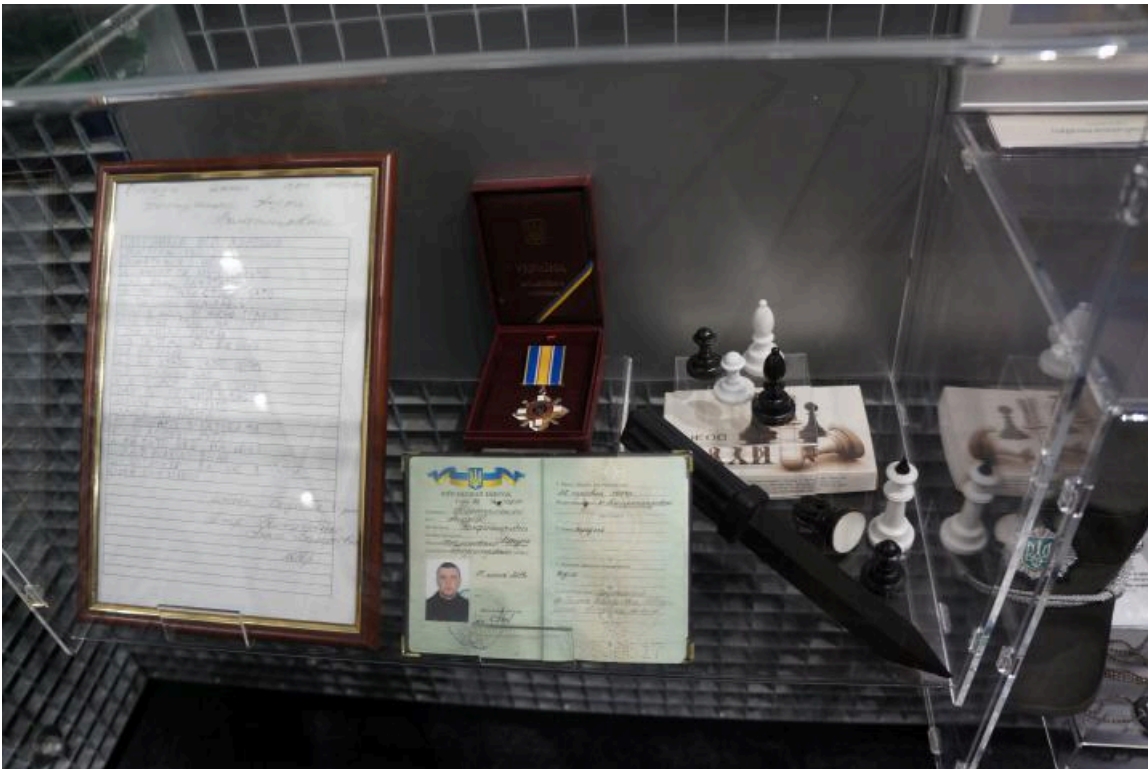
Artefacts in museums are primarily items offered by participants in events and relatives of those who fell; Museum of the Anti-Terrorist Operation in Dnipro, September 2018.