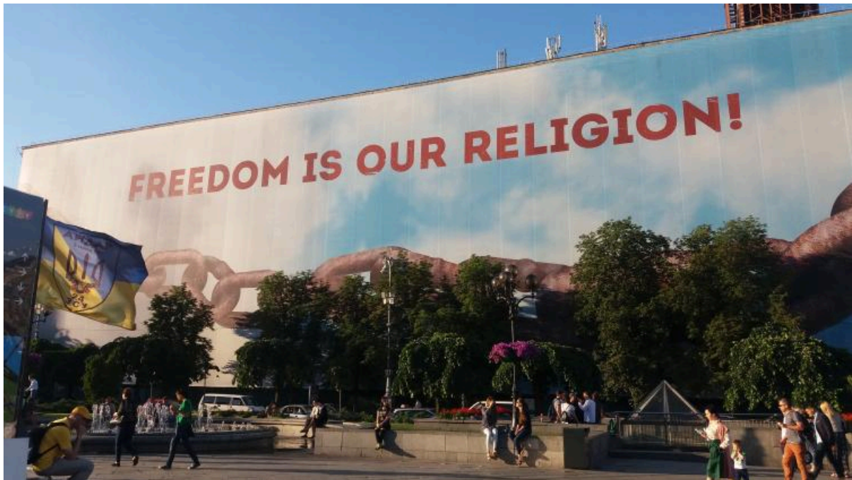
Photo credit: Ukraine sheds its shackles: a banner in Independence Square, Kyiv, June 2017. Elżbieta Olzacka, Free access - no reuse