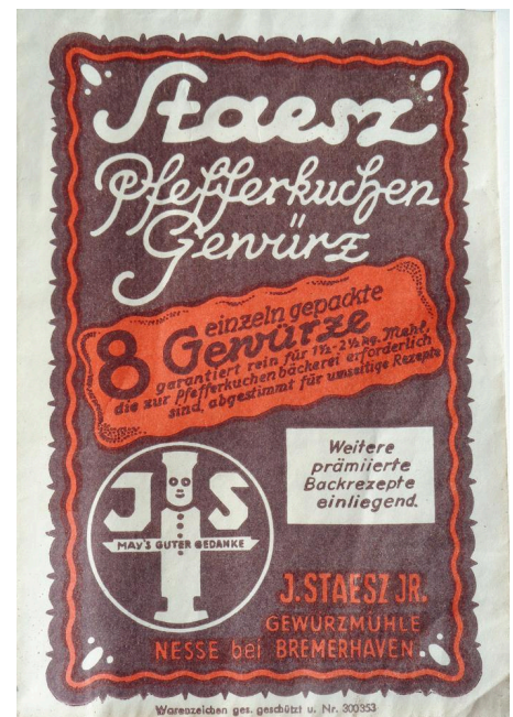
Ein historischer Beutel Pfefferkuchengewürz der Marke "Staesz-Pfefferkuchengewürz".