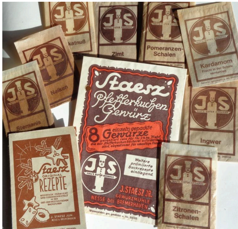
Photo credit: A historical bag of the "Staesz-Pfefferkuchengewürz" with the single spices.. Free access - no reuse